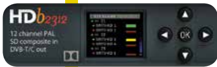
HDb2312 Front Detail