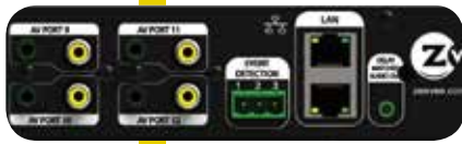
HDb2312 Rear Detail