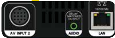
ZvPro600 Rear Detail