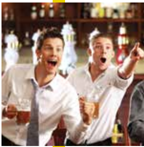
Restaurants, Pubs, & Bars