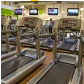
Health & Fitness Clubs