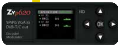
ZvPro600 Front Detail